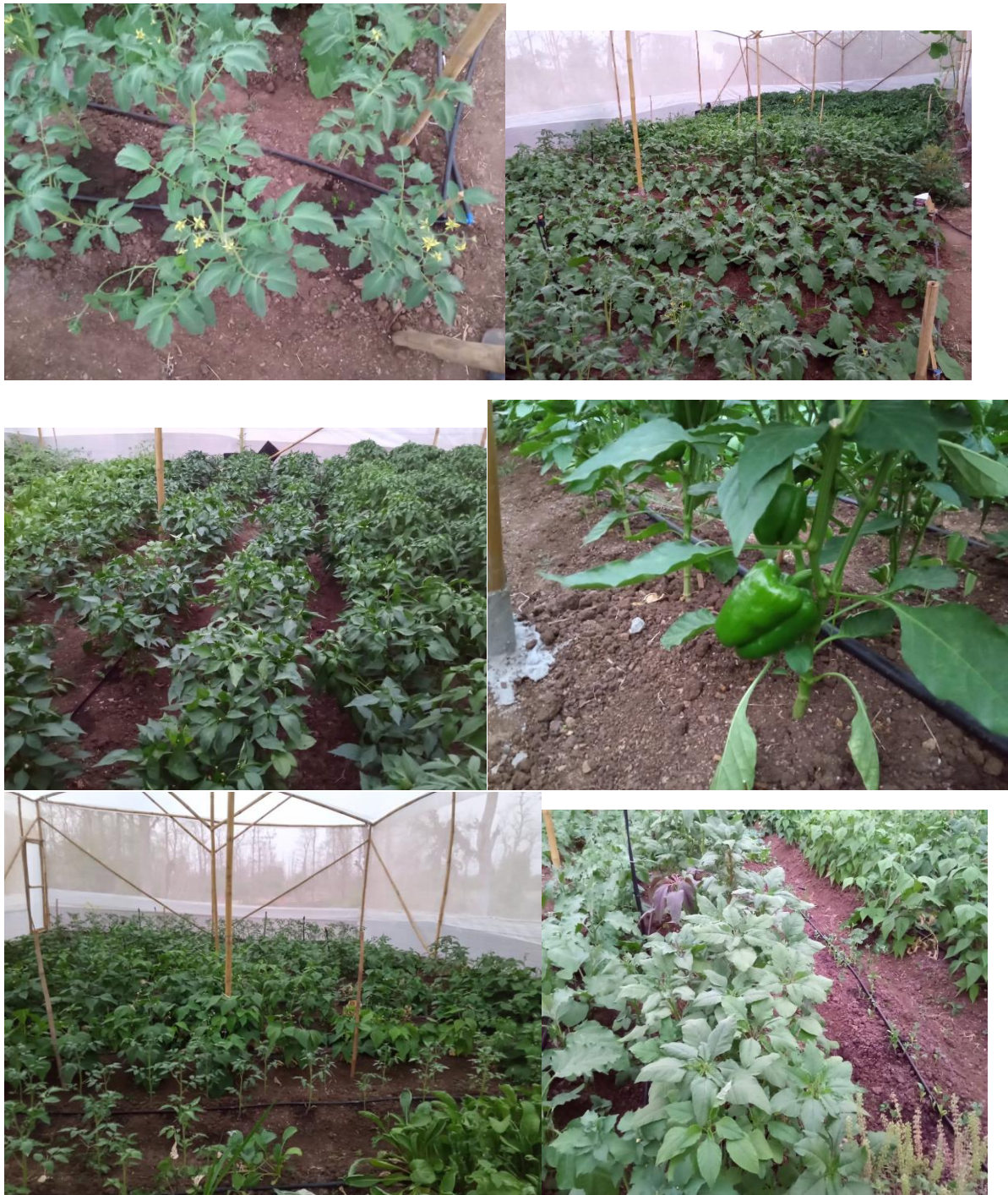
Fig 2 : Images inside Bamboo Polyhouse from Balapur site captured on 13 th April 2021