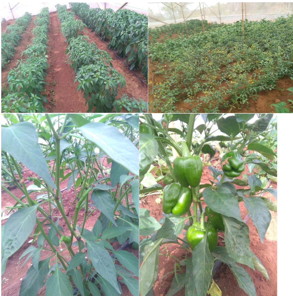
Fig 1: Images of Vegetables inside Bamboo Polyhouse, Village Ramkhind